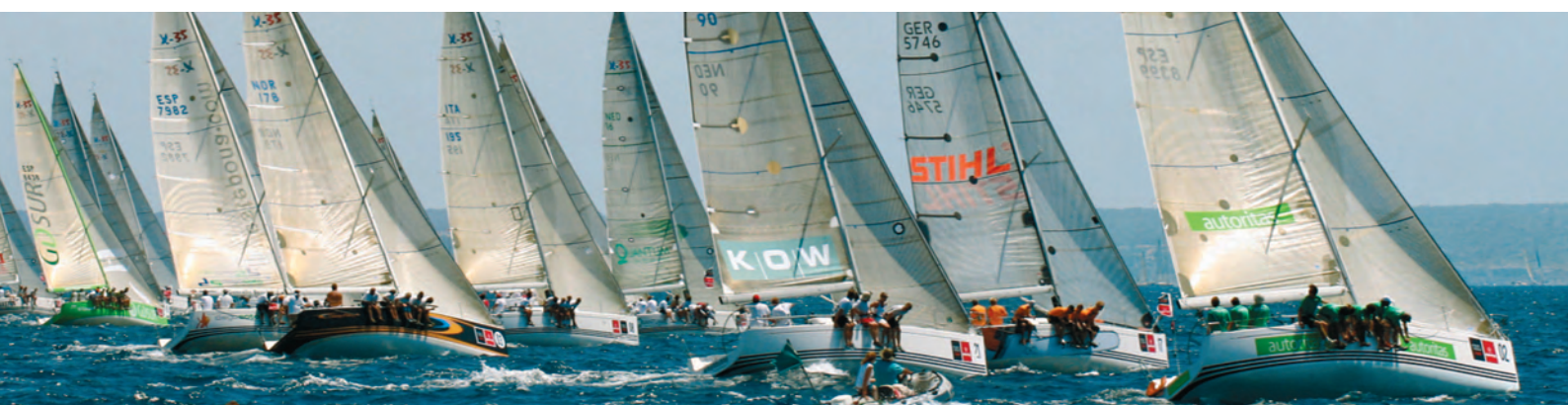
Xracing 35 41 Einheitsklassen mit internationalem anerkannten Status. Der faire Weg des Regattasegels. x-yachts.com