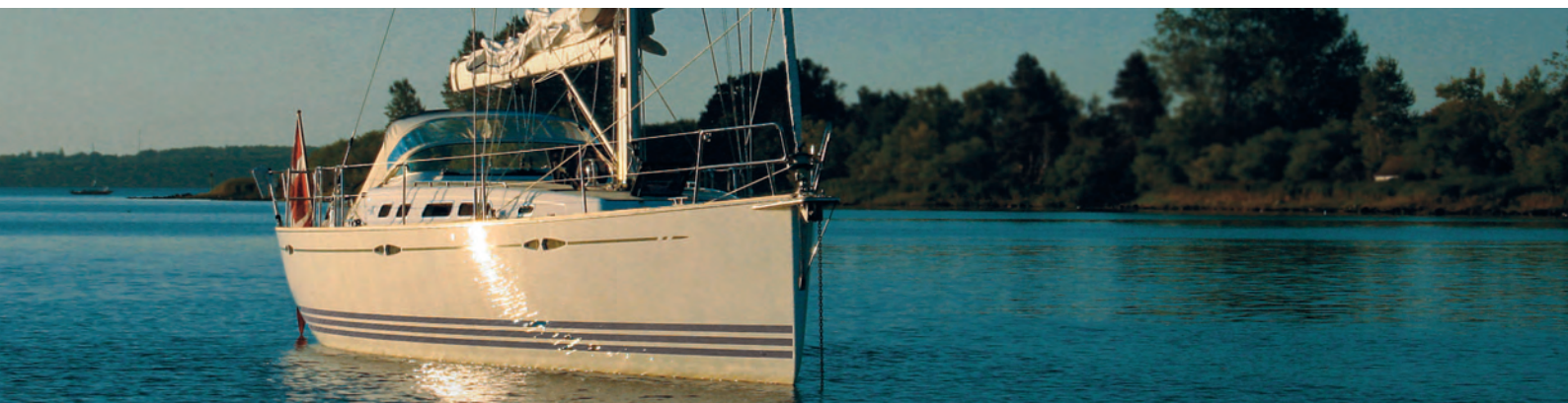
Xcruising 42 45 Komfortables Fahrtsegeln ausgestattet mit hervorragenden Segeligenschaften.