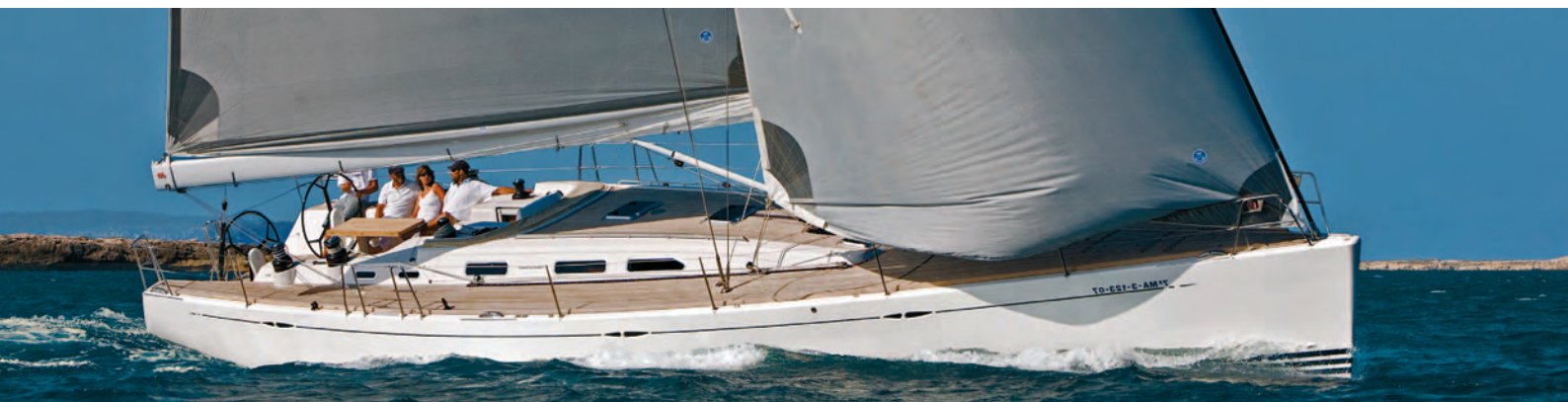
Xperformance 34 37 40 43 46 50 55 65 Stil, Komfort und kompromissloses Segelvergnügen mit Gefallen für Sportlichkeit.